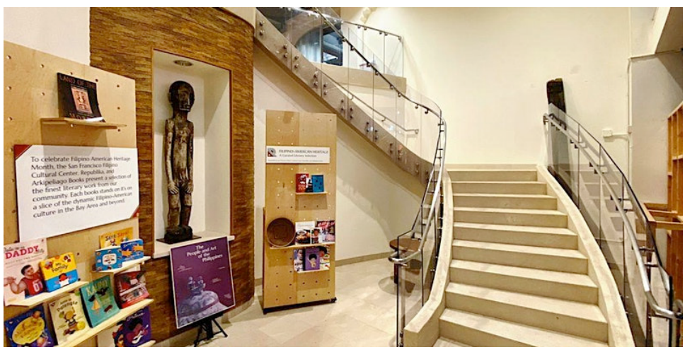
SF Filipino American Chamber of Commerce Mixer by San Francisco FilAm Chamber of Commerce Date and time: Wed, May 4, 2022 • 5:00 PM – 8:00 PM PDT

Register here: https://www.eventbrite.com/e/los-angeles-job-fair-los-angeles-career-fair-tickets-193063467027?aff=ebdssbdestsearch