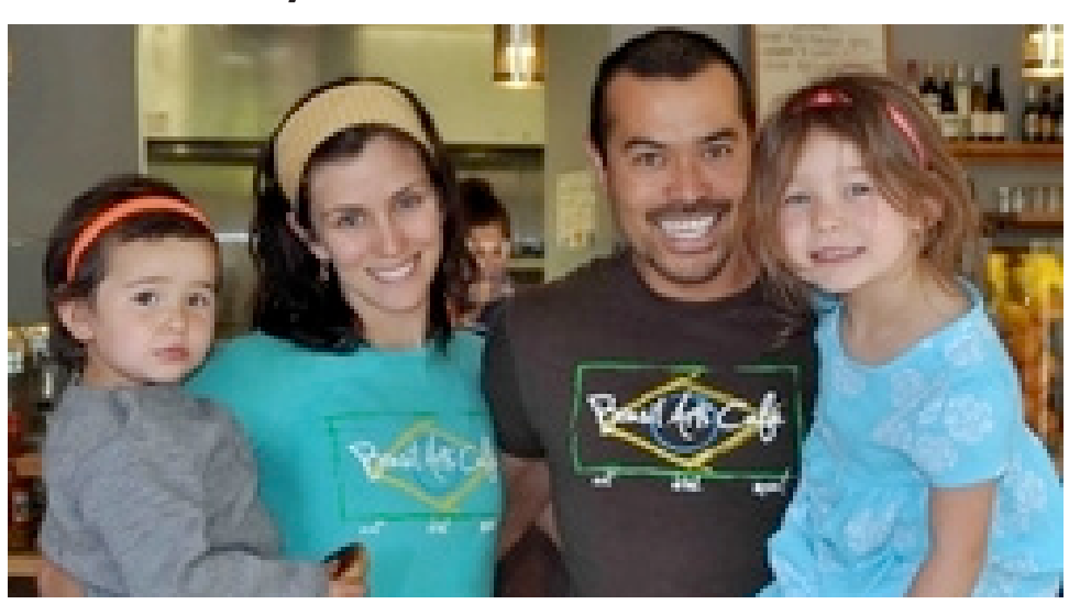
[ Article originally appeared in https://cameonetwork.org ]

Bringing Brazilian culture to Santa Barbara through authentic food, dance fitness, and live music.